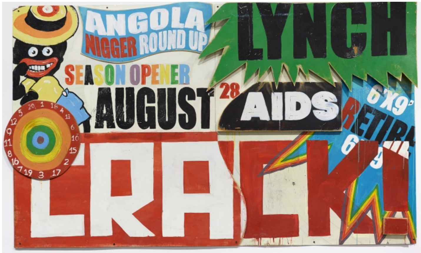
Multi-Generation Trauma, The History They Forgot To Teach 2019 // Mixed media on wood panel 72x48in