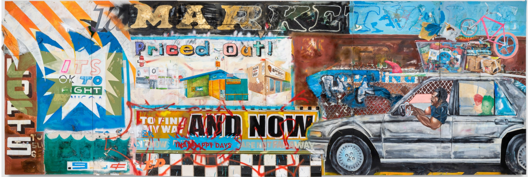
Happy Days 2020

Spray paint, oil, acrylic and mixed media on wood panel 288x96in (24x8ft)