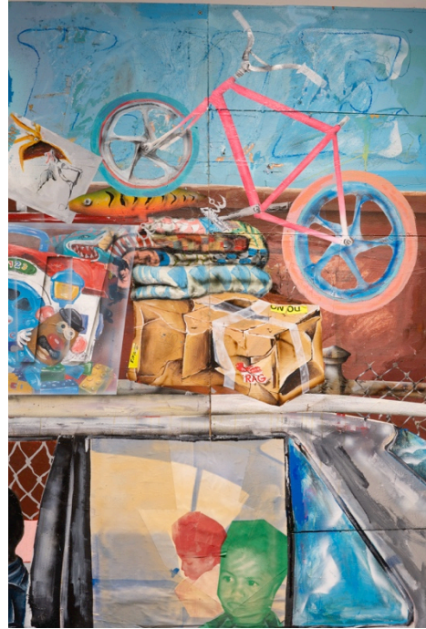
Happy Days (Detail Shots)