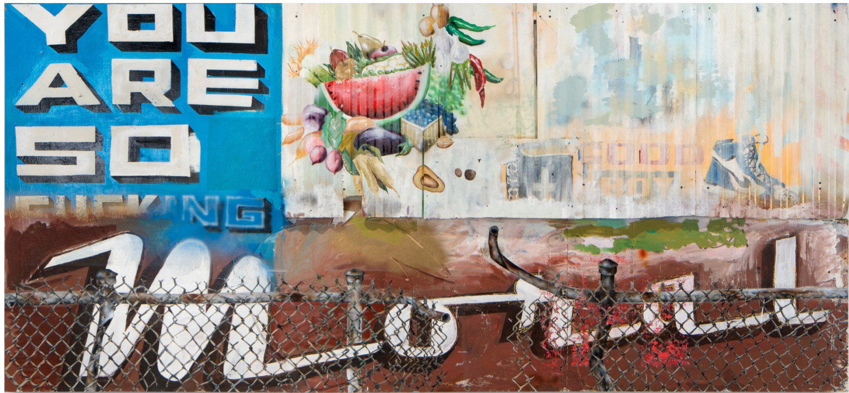
Be Good, You Are So Moral 2020

Mixed media, exterior paint on wood panel 144x68in