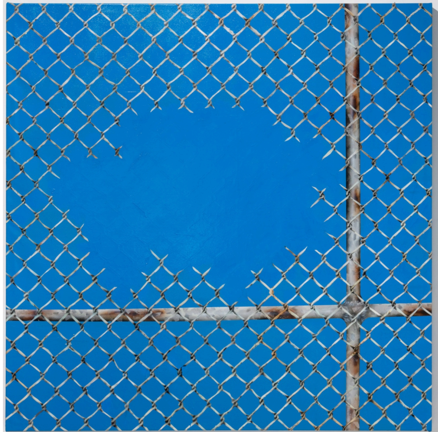
Beware of Dog (Triptych) 2020 Spray paint, enamel and acrylic on canvas 96x60in