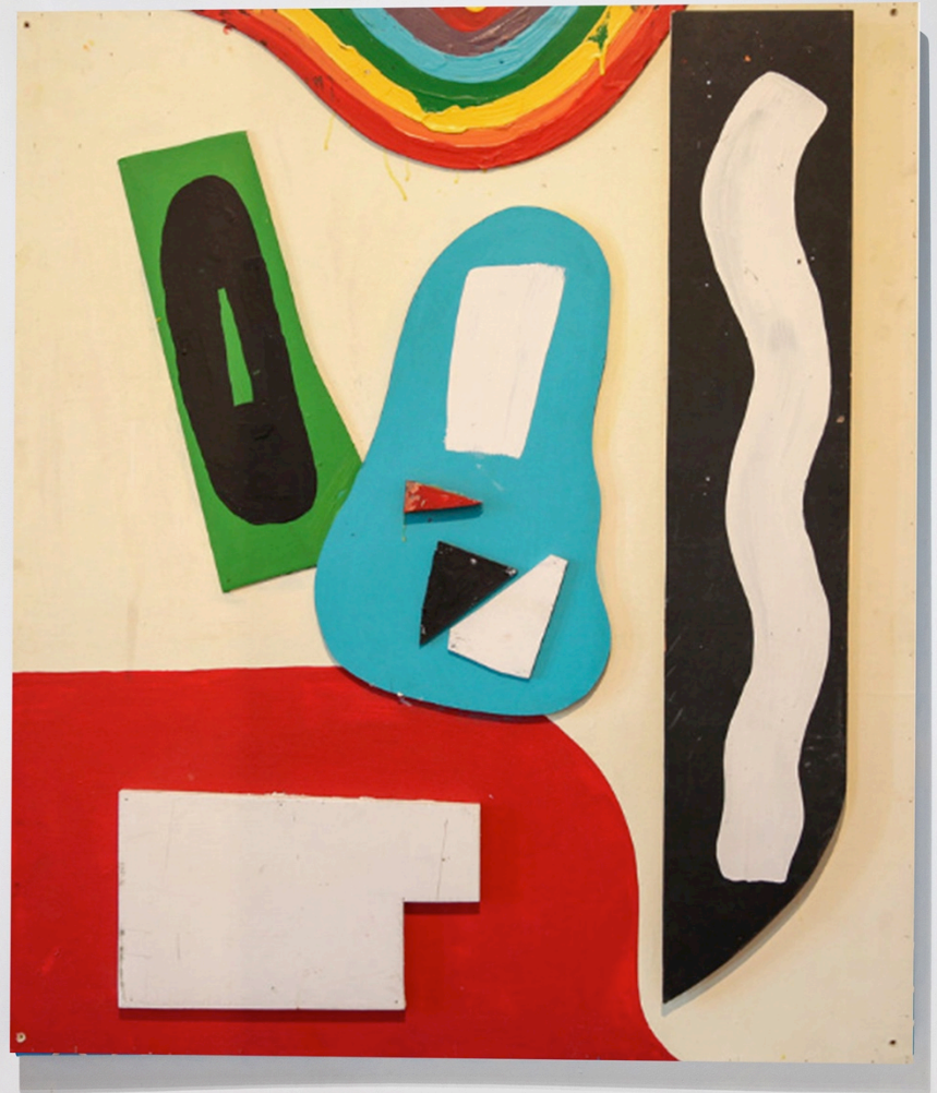
Abstract #1 2019 // acrylic, latex, oil paint and paper on wood panel 48x48in