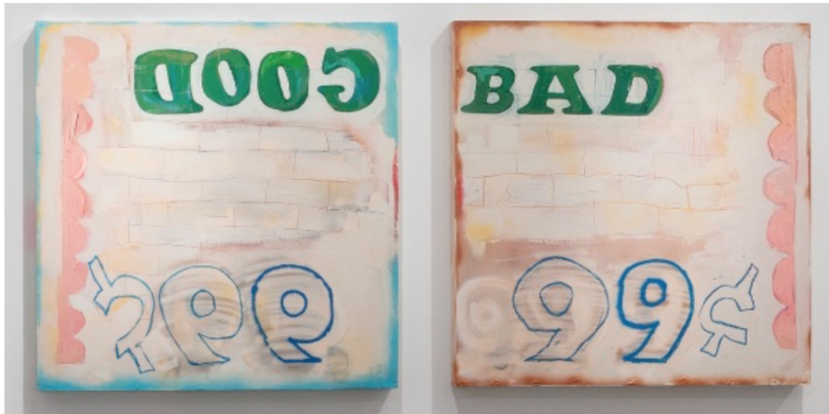
Super Good, Kinda Bad 2019 // Mixed media (diptych) 96x48in