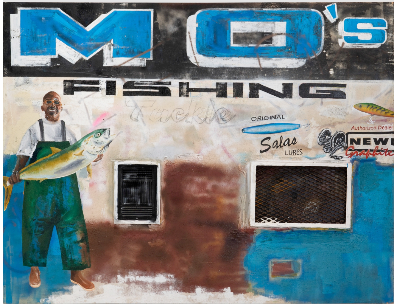
Mo's Fishing Tackle 2020

Mixed media, exterior paint on wood panel 96x74in